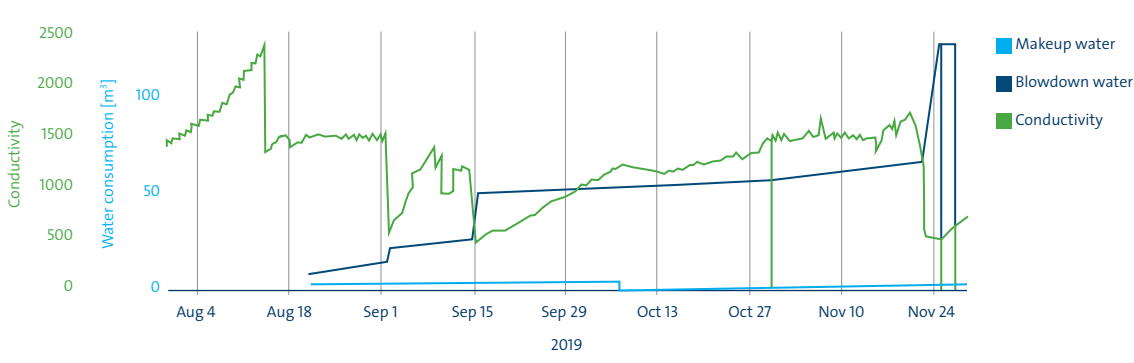
Inefficient manual Blowdown control on site

According to the facility manager, the company also struggles with time consuming legal compliance reporting. The logging and tracking of data are done manually, which wastes a lot of time and creates a risk of inaccurate reporting.