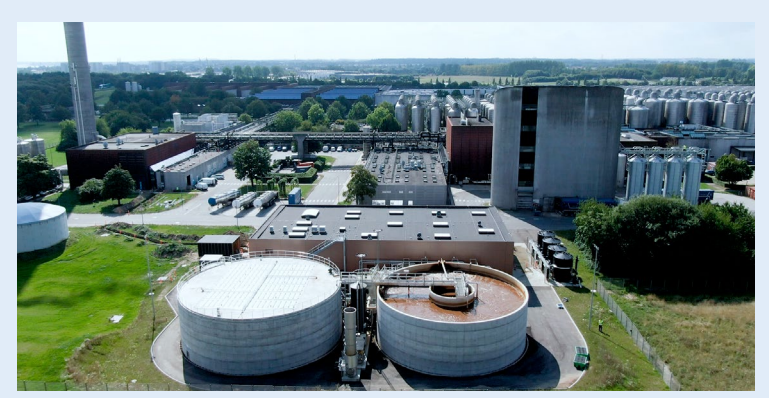
Carlsberg's Total Water Management plant at its Danish brewery

This has been a dream for us says the company's brewing director.<sup>24</sup>